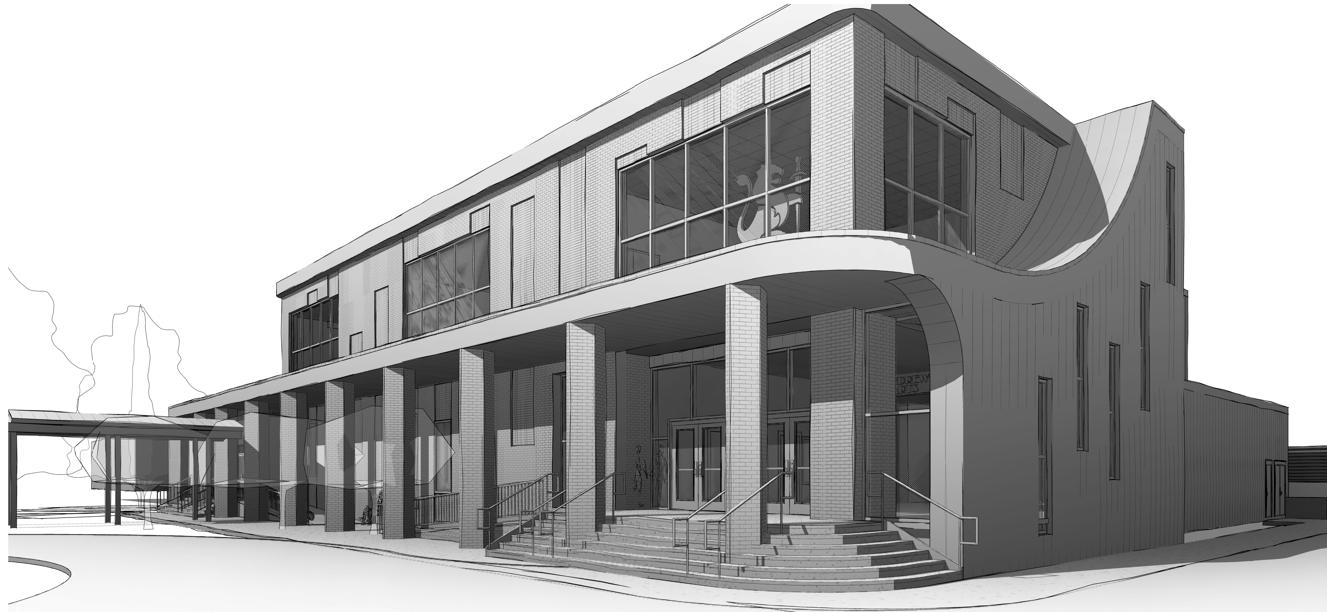
PERSPECTIVE VIEW FROM CORNER