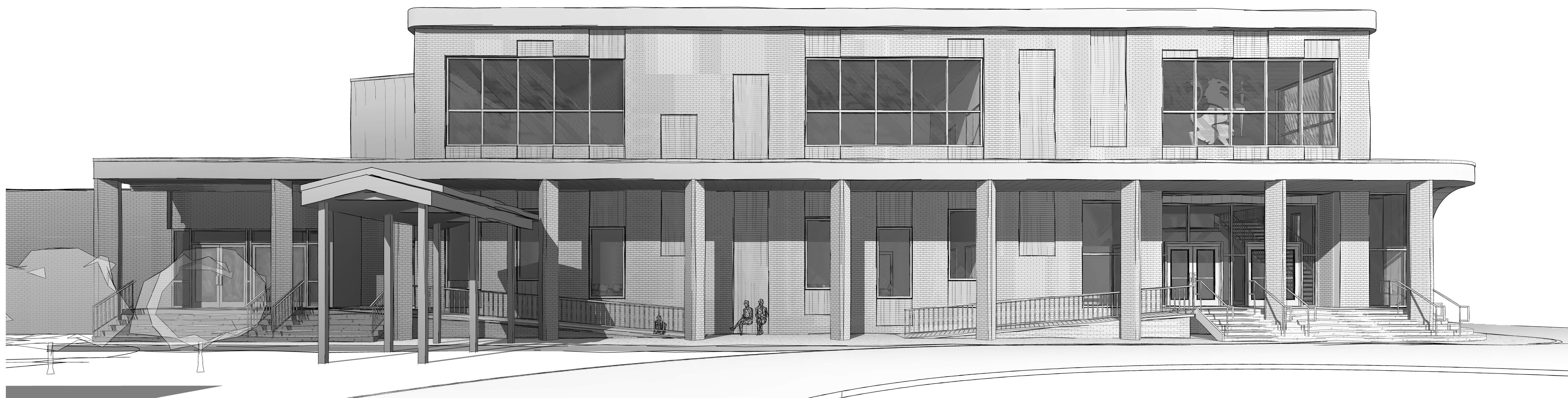
PERSPECTIVE VIEW FROM FRONT